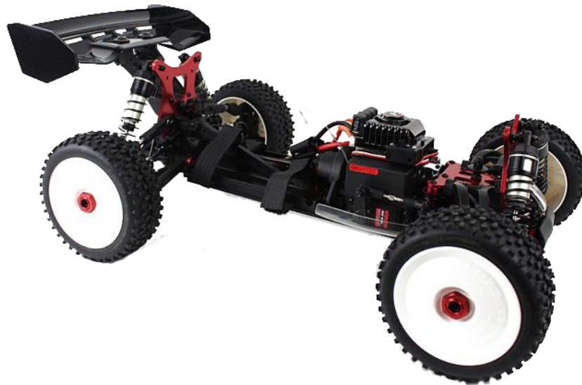
Figure 1: Our platform choice - SWorkz S350 BX-1E 1/8 Sport ARTR Buggy Roller

to hold all other physical components such as the DRV8301 kit, the motor, the batteries, etc... We also wanted to make sure that we did not select a platform that was so large that it would require a large amount of power to accelerate. As a group we determined that a 1/8 scale car would be the ideal size. We then looked for a vehicle that had good suspension and weight distribution. This is important for balancing all hardware components and ensuring stable steering. Another major factor we looked at was tires. Upon completion of the project, TI asked us to test the device on various terrain such as dirt, sand, grass and concrete. Therefore we needed sturdy tires capable of performing effectively in all these environments. Factoring all these variables we then considered cost. We knew that the platform was going to be a major portion of our budget. We then narrowed our search and ultimately decided that the SWorkz S350 BX-1E 1/8 Sport ARTR Buggy Roller was the best match for our criteria. It is pictured below.