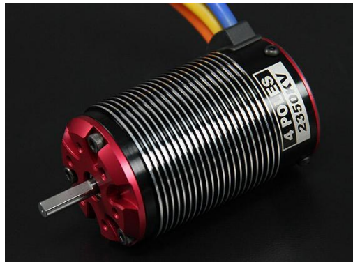
Figure 2: Motor Selection - Turnigy TrackStar 1/8th Sensored Brushless Motor

The motor is what will physically drive our RC car. The motor receives commands from the controller which will drive its rotor causing it to spin. This force will drive the back 2 wheels of our platform, either forward or backward, causing it to move. Our motor will be controlled by the DRV8301 kit as described above. The DRV8301 kit can handle anywhere from 6 - 60V. Therefore in choosing a motor we looked at, among other factors, torque, speed, size, power and cost. We found a Turnigy TrackStar 1/8th Sensored Brushless Motor that was small (~0.8lbs) and yet still very powerful (2350kV RPM/v). An advantage of this motor is that it is designed for use in RC cars. The motor is pictured below.