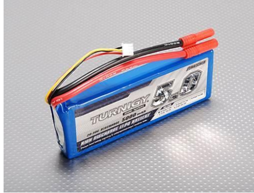
Figure 3: Battery Selection - Turnigy 5000mAh 2S 20C Lipo Pack